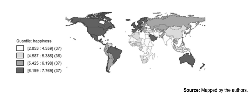
Figure 1 Quantile Map of Happiness

each country. The dark color on the map shows the happiest regions. Variation of color intensity on the map from dark to light indicates the happiness levels of the countries from high to low. Finland, Sweden, and Norway, for example, are among the happiest regions of the world. In 2019, the happiness rates were generally distributed among developed countries.